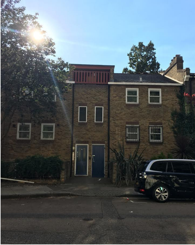
Image 1: Photographs of front of the site (5 on left, 5A on right)